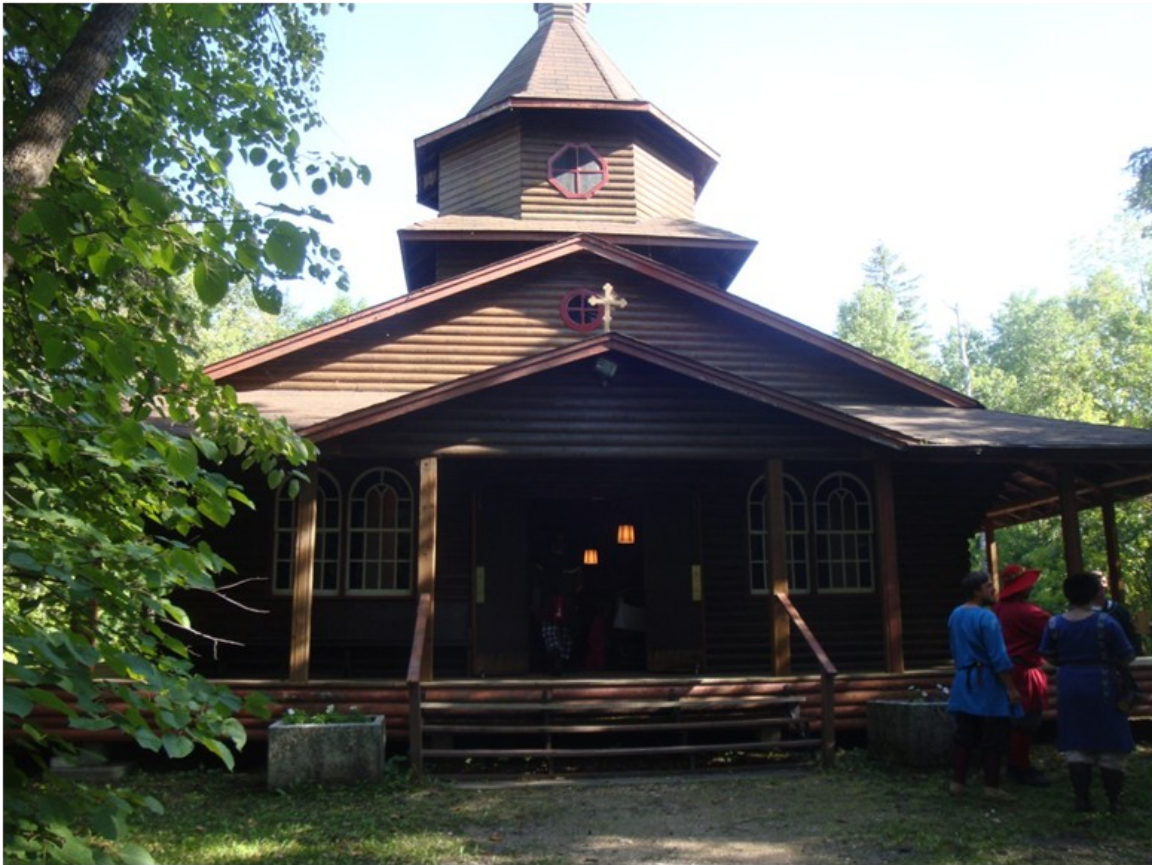
The beautiful church, where court was held.