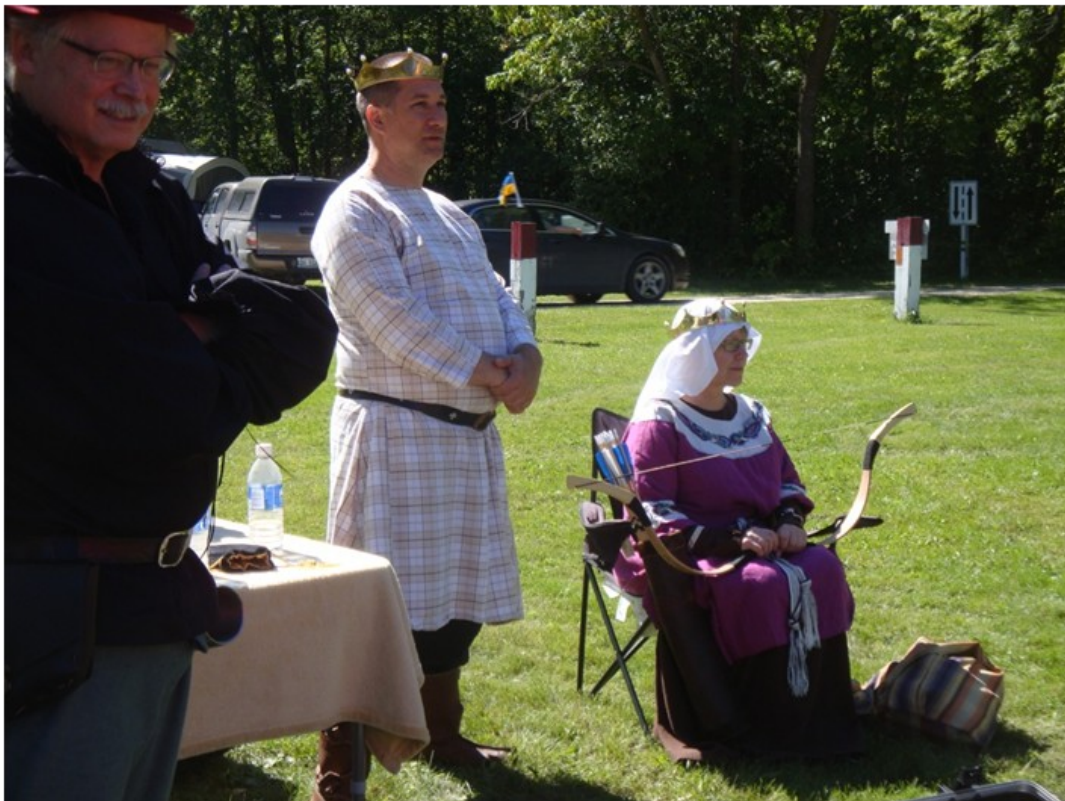
Watching (and participating in) the archery.