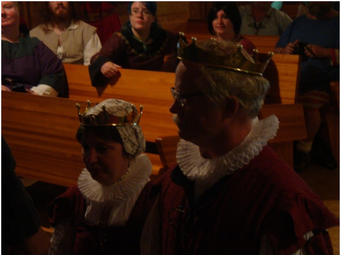
The newest Territorial Baronage of Northshield.