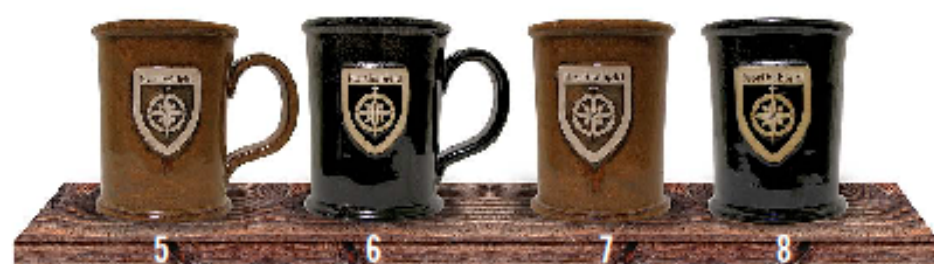
5 Straight Shot - 16 oz. (with handle)