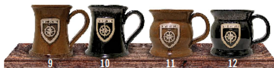
9 Fresh Awakening – 14 oz.