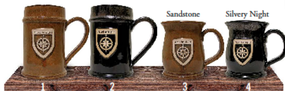
1 Tall Boy Tap – 24 oz.

New for 2012! 4 New Styles! 2 New Glazes!